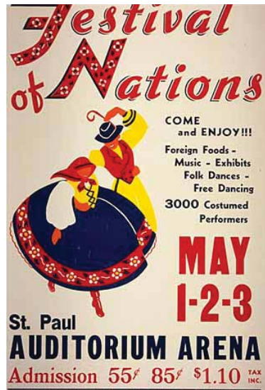
Festival of Nations, 1930s