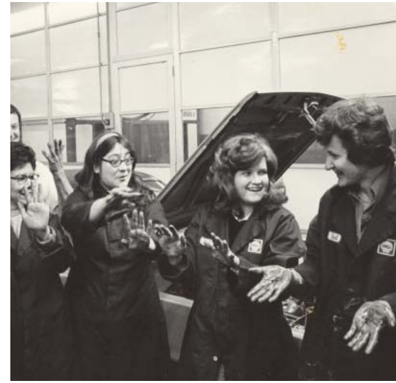
Auto Repair Class, 1960s