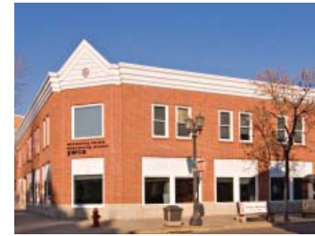
YWCA at Selby & Dale, 2006