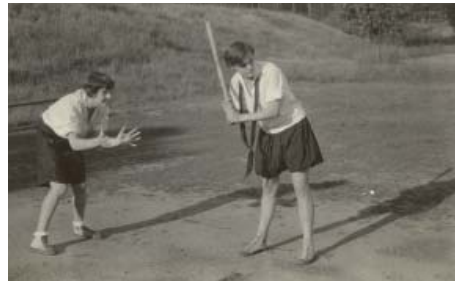
Baseball, 1928 (top)