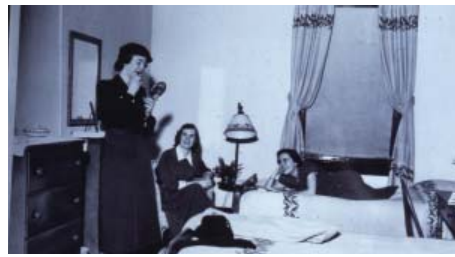
Residence Room, 1930s