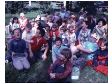
Camp, 1970s (top)