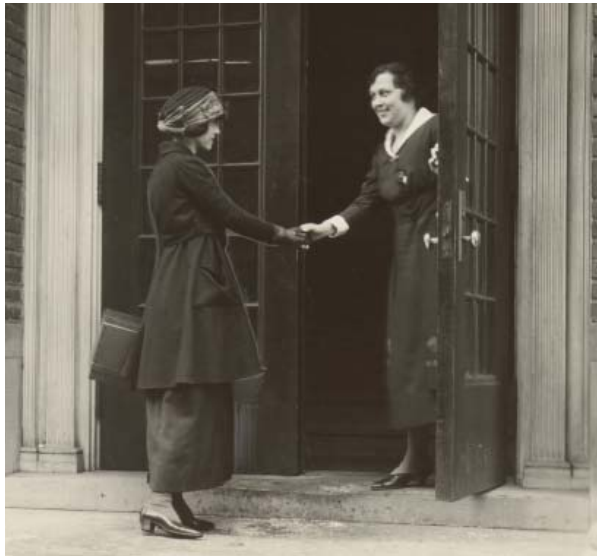
Welcoming a new resident, 1920

The YWCA St. Paul was started by a group of forward thinking St. Paul women 13 years before women had the right to vote! Founded to provide refuge and support for the young women who moved to St. Paul pursuing work in the factories and mills, our programs have continually evolved to meet changing community needs. Today, we equip and empower women, children and families to grow and thrive through programs and supportive services in housing, health, education and employment.