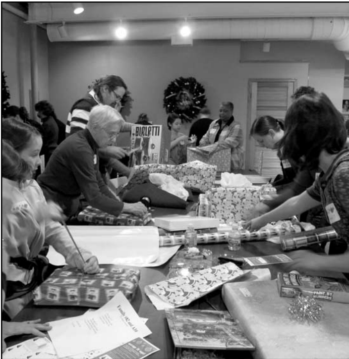
Attendees at the 2009 Holiday Wrapping Party.

The mistletoe's been hung. The presents are here. Please join us in wrapping the bounty this year! Join us Saturday, December 11 as we gather to celebrate the season and wrap holiday gifts for homeless women, children and families.