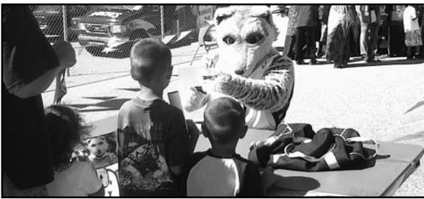
YWCA St. Paul helped organize the LEAP Forward Collaborative's Back to School Event where families enjoyed free entertainment, a resource fair, meal and even backpacks stocked with school supplies. Nearly 500 backpacks were distributed! Special thanks to World Vision, Timberwolves and Project Voice for making the event possible!