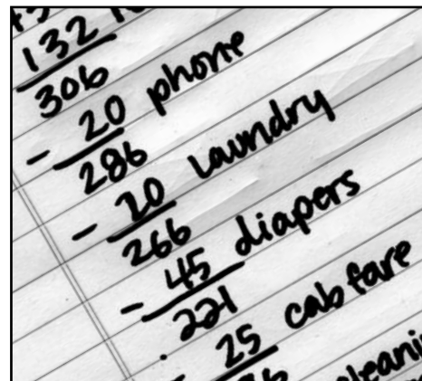
A monthly budget is just one tool used by case managers as they work with families to put homelessness in the past.

In addition, the State has also conducted an external audit and issued reimbursement to the families who had been impacted by the monthly reduction. “This is a wonderful outcome for homeless women,