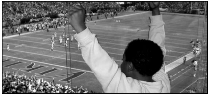
Thanks to a generous donation from Tix for Tots, youth from our Youth Achievers Program (YAP) had the opportunity to cheer on the Vikings from a private suite at the Metrodome!