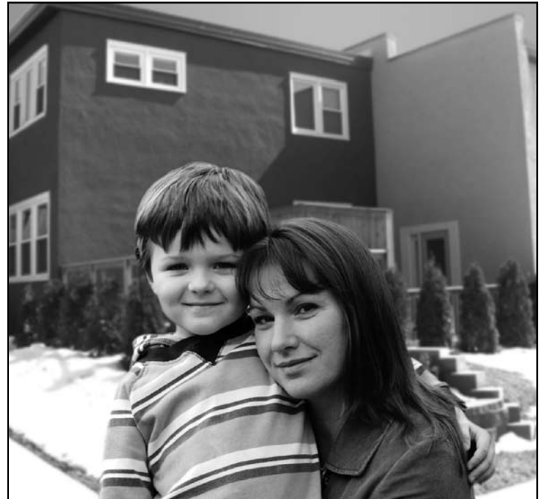
Eleven townhome-style units located in Highland Park will be renting soon.

Staff are currently working to get the building ready for tenants who are expected to begin moving in by January. To accommodate the winter weather and the busy holiday season, the YWCA will celebrate the opening of Cleveland Saunders with