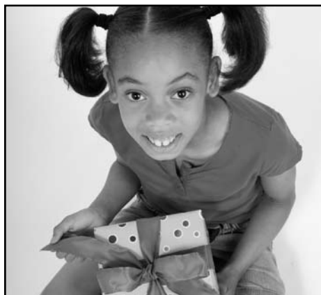
Help wrap up some holiday cheer on December 13.

The mistletoe's been hung. The presents are here. Please join us in wrapping the bounty this year!