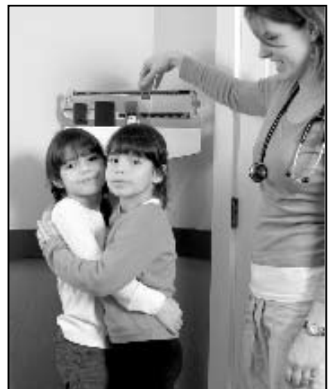
Students work with families to achieve better health.