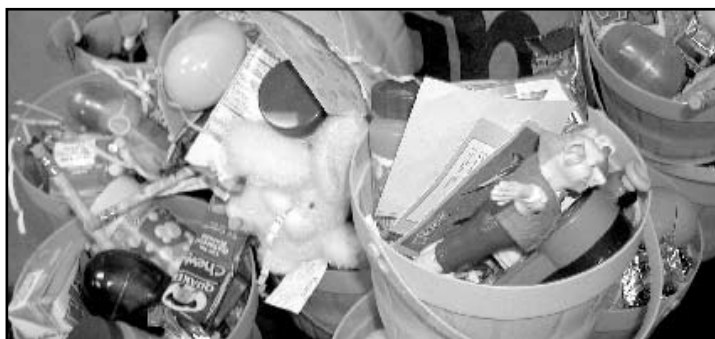
Even the Easter Bunny needs a helping hand. A generous volunteer and donor, provided 60 Easter baskets for children enrolled in YWCA Housing & Supportive Services programs.