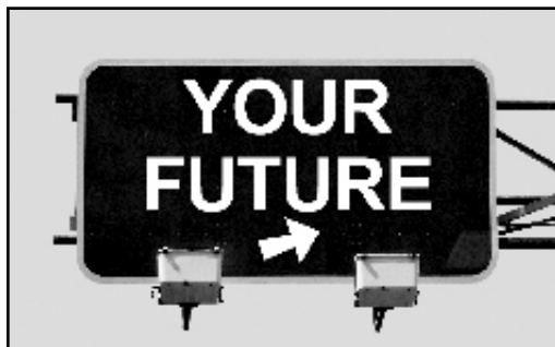
Charting a course for high school and beyond.

Each Monday at the YWCA, the conference room fills with a group of young people who are focused on what lies ahead. Whether high school graduation is a year away or just a few months down the line, it is an exciting and stressful time for everyone at the table.