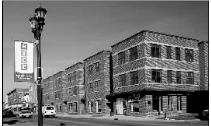
YWCA St. Paul serves a growing number of families at community housing sites like Legacy’s Winnipeg Apartments.