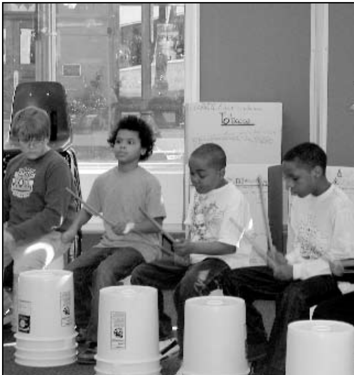
Participants from the Youth Achievers Program (YAP) showcased their many talents during a spring talent show.