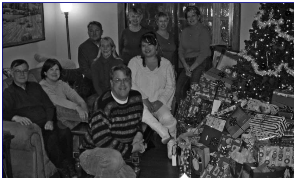
Members of Fabulous Fern's Horseshoe Club gather around donated gifts.

This holiday season, families enrolled in our Housing and Supportive Services programs received a wonderful gift – the knowledge that their community cares! All around the neighborhood, groups and individuals worked together to make sure families in need could celebrate the season.