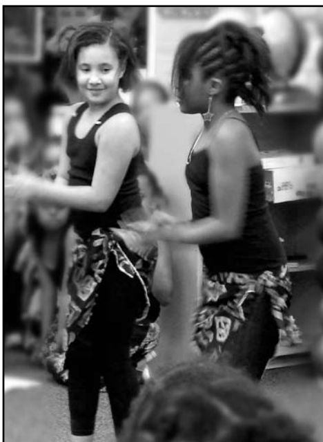
Girls performing a traditional African dance.

Interested in volunteering at an upcoming family night? Please contact Christina McCoy at (651) 222-3741.