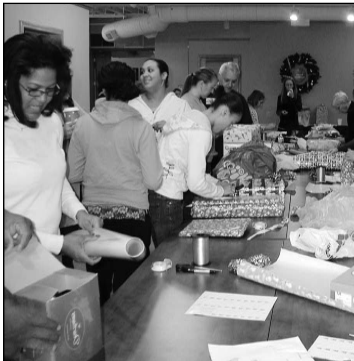
Friends, members and neighbors came together to make the holidays bright for families in need during the 2008 Holiday Wrapping Party. To see more photos from an exceptional season of giving, please visit www.ywcaofstpaul.org/HolidayThanks.html .