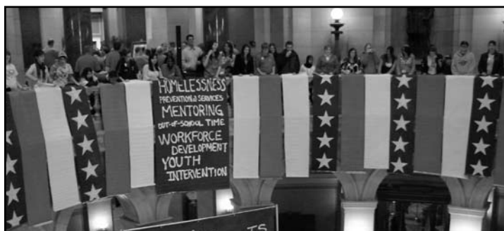
Youth from the Youth Achievers Program and Leap Forward Collaborative had the opportunity to meet with their legislators and participate in Youth Day at the Capitol.