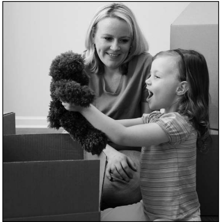
During December 2008, 19 families moved out of the emergency shelters and into housing with help from the YWCA St. Paul.

Rapid Rehousing is just one way the YWCA St. Paul helps families to fight homelessness. To learn more about the full range of Housing and Supportive Services at the YWCA St. Paul, please visit us online at ywcaofstpaul.org .