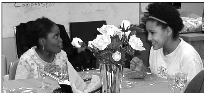
Girls learn etiquette during a November event sponsored by the AKA Sorority sisters.